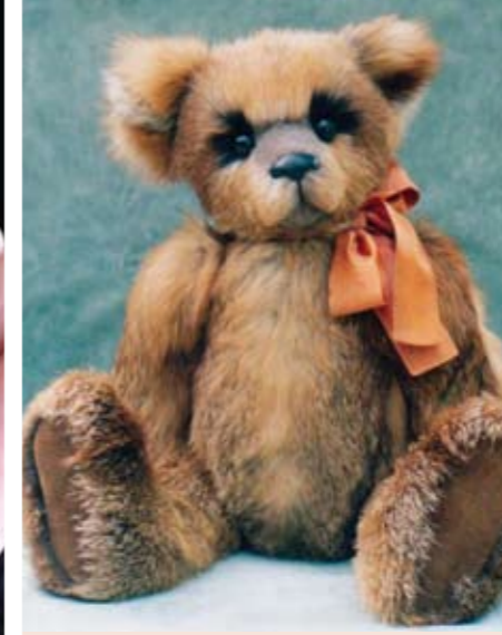
Foxy at Fifty by Brigit Charles - Brigit's Bears. Made to order for a 50th birthday, Brigit was inspired by the beautiful colour and texture of the fur.